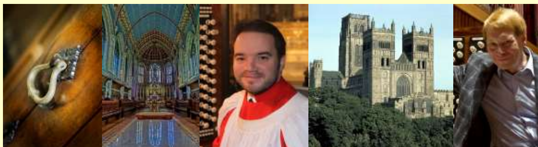
KNOCK – EXPLORE AT USHAW!

AN INVITATION TO ORGANISTS AT ALL AGES AND STAGES, OBSERVERS, AND ALL SEEKING A SPRING BANK HOLIDAY WEEKEND OF INSPIRING MUSIC-MAKING AND CULTURAL EXPLORATION IN DURHAM'S STUNNING, HISTORIC SETTING