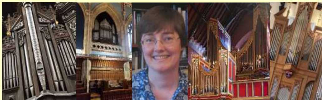
COLLINS ORGAN, ST OSWALD'S