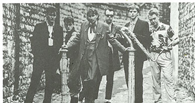
1 Choir of Christ Church Oxford 2 Fine Arts Brass Ensemble 3 Harvey and the Wallbangers

See inside for details of twelve concerts, exhibitions and summer school