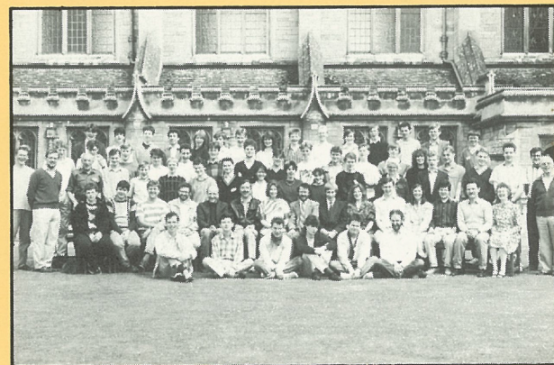
STUDENTS AND TUTORS AT OIOW 1988