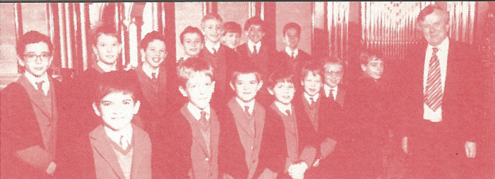
Choir of St. John's College, Cambridge