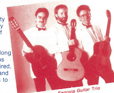
Segovia Guitar Trio

Saturday July 14 is a day-long celebration as street organs play, classic cars are admired, crafts displayed and sold and local charities set up stalls to benefit good causes.