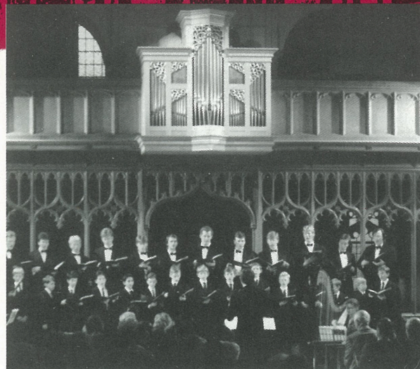
Choir of Christ Church Cathedral: 1991 Festival