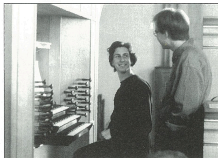
Summer School 1993

Full details of works to be studied will be sent to all applicants.