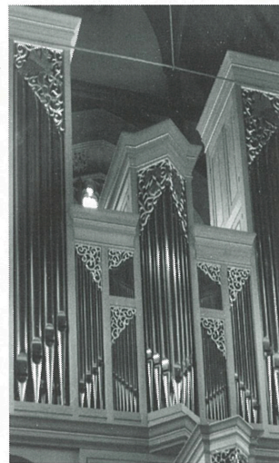
Frobenius organ in Oundle School Chapel

The cost will be £140 for the week or £25 on a daily basis. All meals except breakfast are included in the charge, together with admission to concerts. We shall be happy to help observers arrange hotel, B&B or camping accommodation in the area. Please apply by letter or telephone.