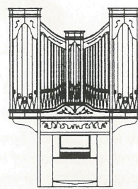
Quidenham Carmelite Monastery (under construction)

The restoration of the 3 manual 1870 Hill organ at Holy Trinity Richmond is in hand.