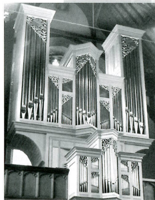
Frobenius organ, Oundle School chapel

We often help with contacts and suggestions for periods of organ study abroad; sometimes too we can assist financially.