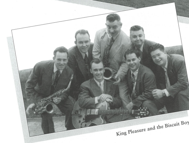
King Pleasure and the Biscuit Boys