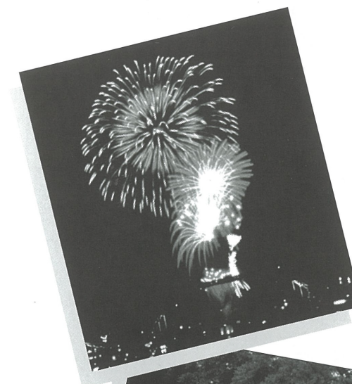
Our 1996 Fireworks Concert