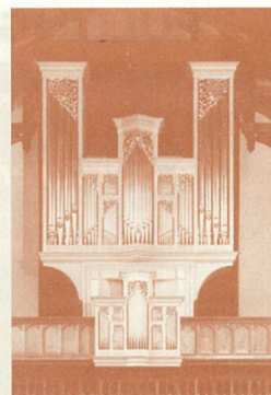
Frobenius organ in Oundle School Chapel