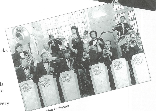
The Cotton Club Orchestra