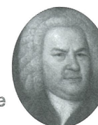
J S Bach

Sonata no 2 in A minor, BWV 1003 Grave; Fugue; Andante; Allegro