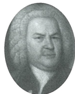
J S Bach

Making the most of limited musical material, the pieces in this evening's programme all have a certain minimalist character, each in their own distinctive way. They tell a story about limitation as an artistic, creative impulse.