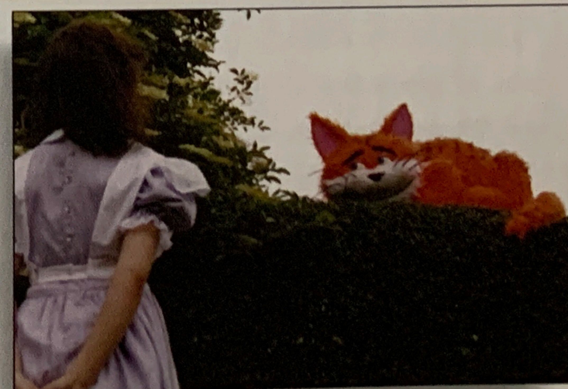
Scene from Alice in Wonderland (Tuesday)

Oundle International Festival reserves the right to make any changes to the published programme that may prove necessary.