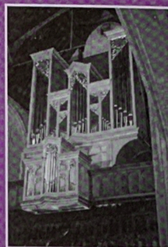
Frobenius organ in Oundle School Chapel