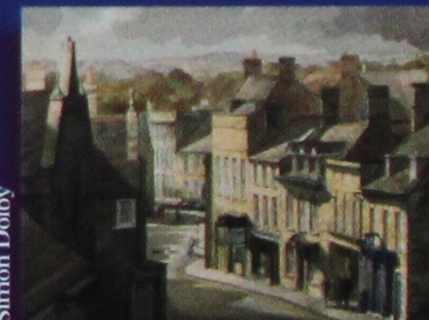
looking down on west street, Oundle Simon Dolby