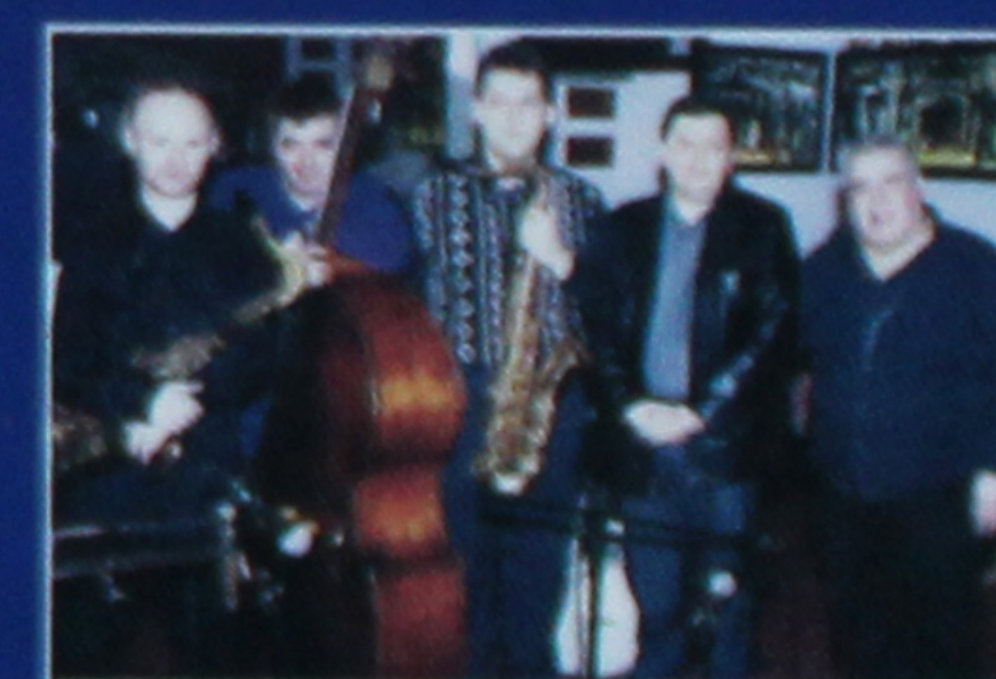
Celebrating the jazz Couriers

lunch, tea and licensed bar. See map for location.