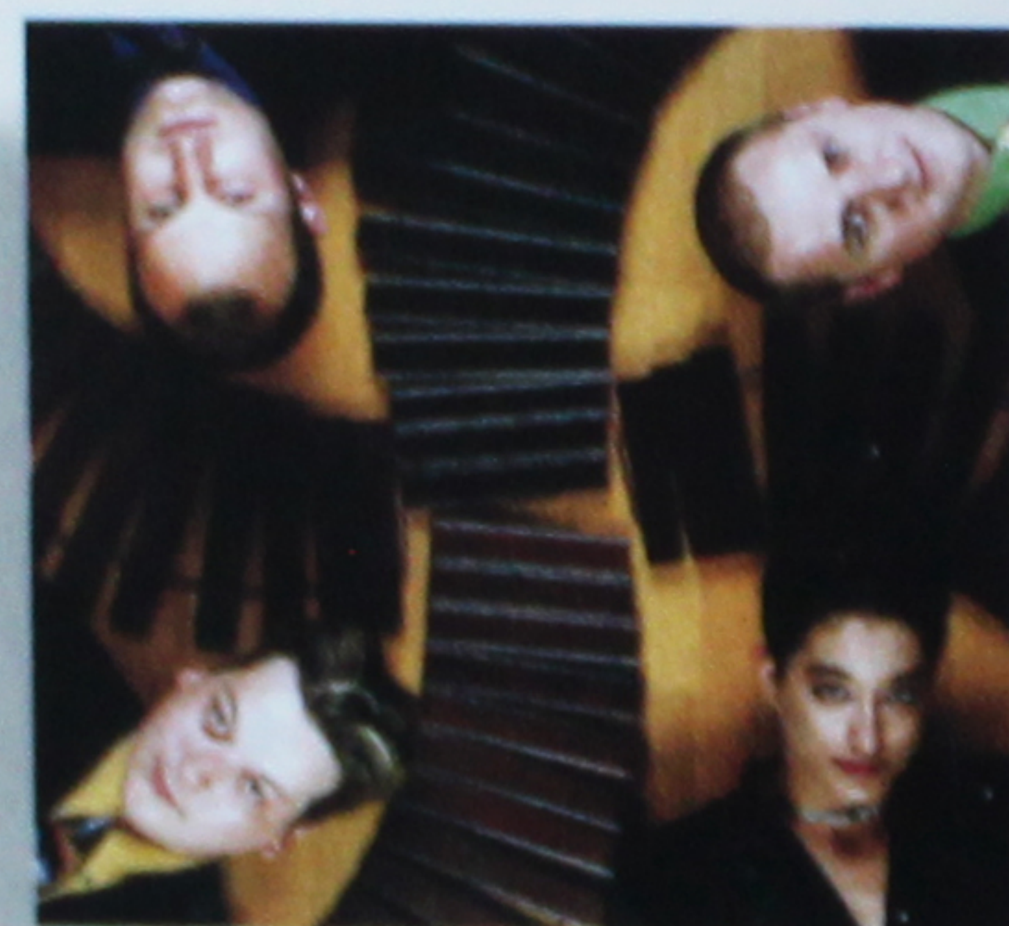
Backbeat Percussion Quartet