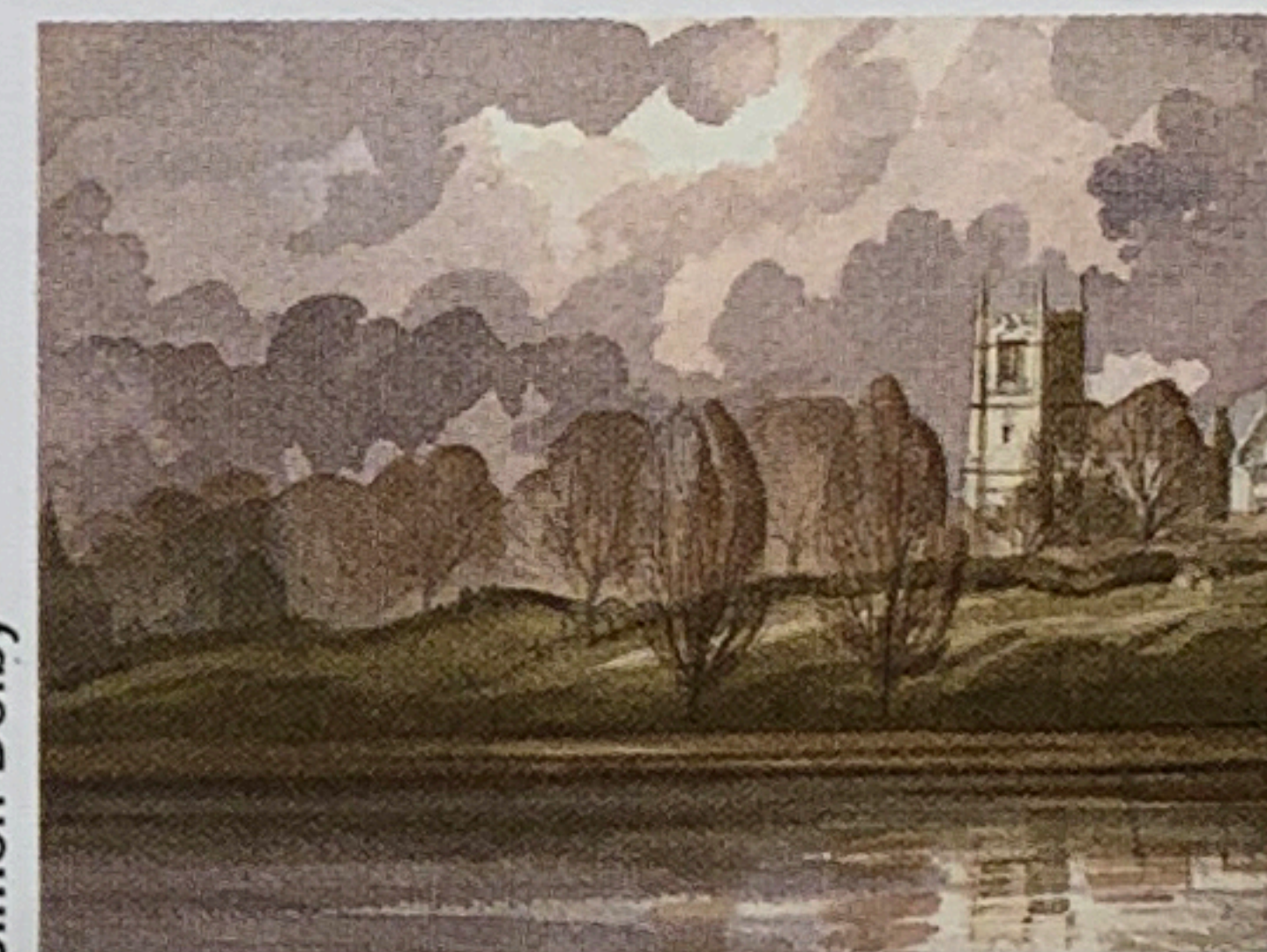
Across the Meadows near Aldwinckle Simon Dolby

Exhibition runs until 24th July 10am - 5pm Monday-Saturday