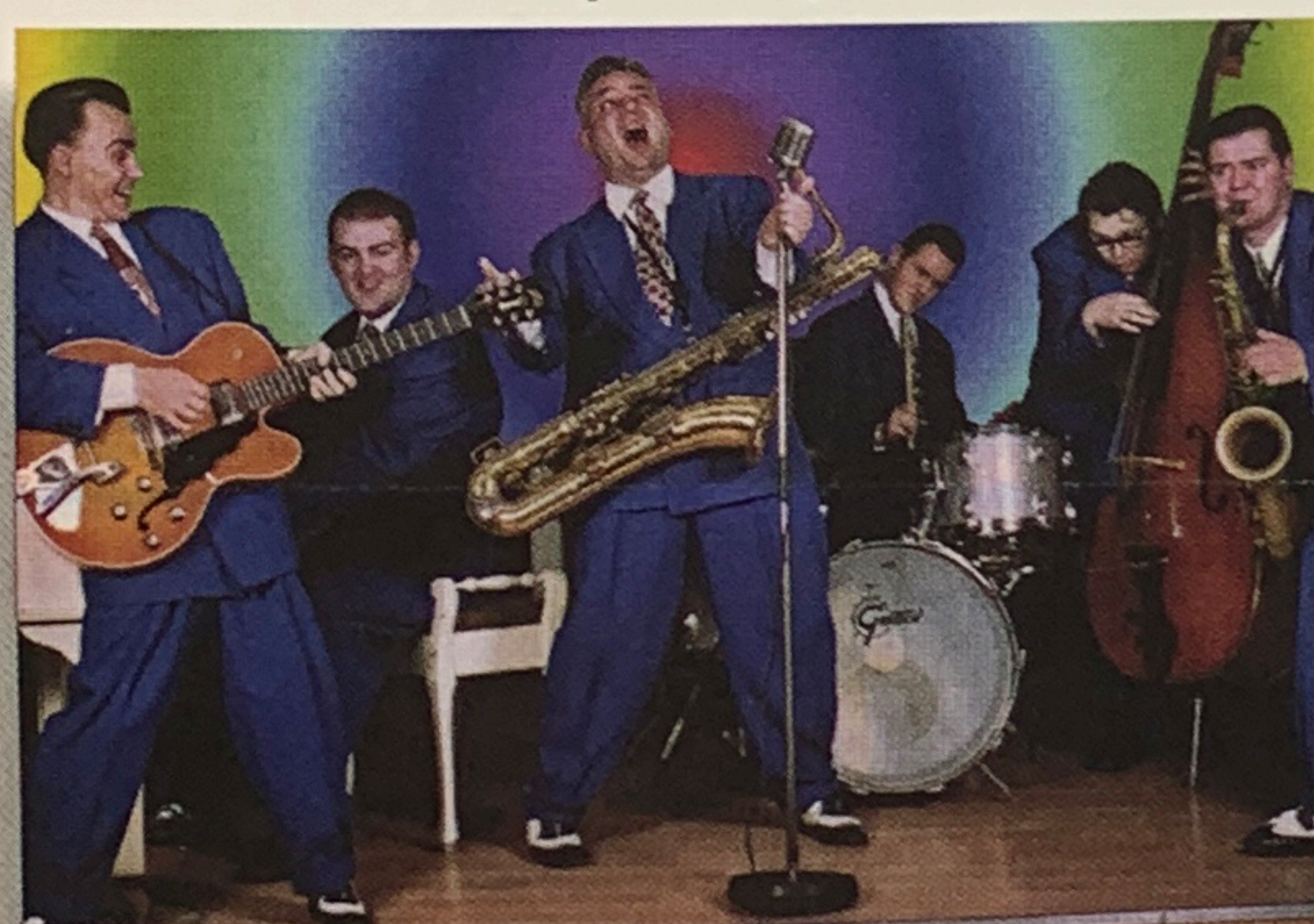
King Pleasure & the Biscuit Boys

Please bring a picnic and chairs or rugs - no seating provided. Bars and barbecue available. Limited number of sites for pre-booked canopies only, at £20 each - please tick box on form.