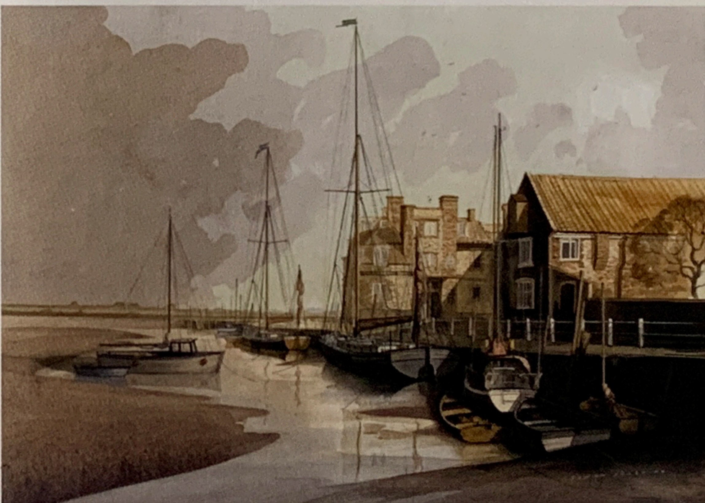
blakeney harbour, norfolk 51 x 71cm (unframed size)