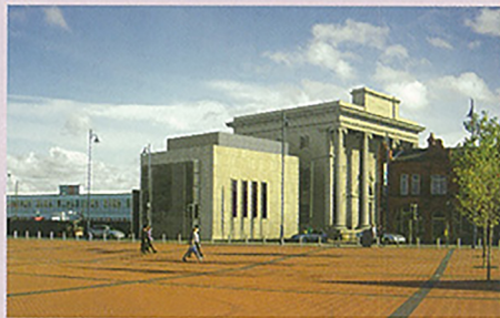
Design for new RCO Headquarters.