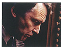
Dame Gillian Weir, DBE Honorary Patron

"Each year Oundle arises like a bright star, clearly visible in the musical firmament. Congratulations on