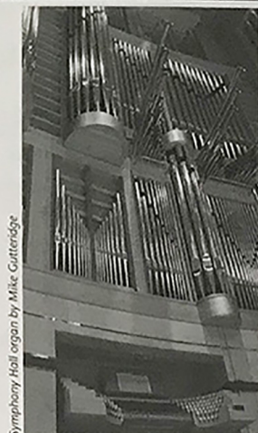
Symphony Hall organ