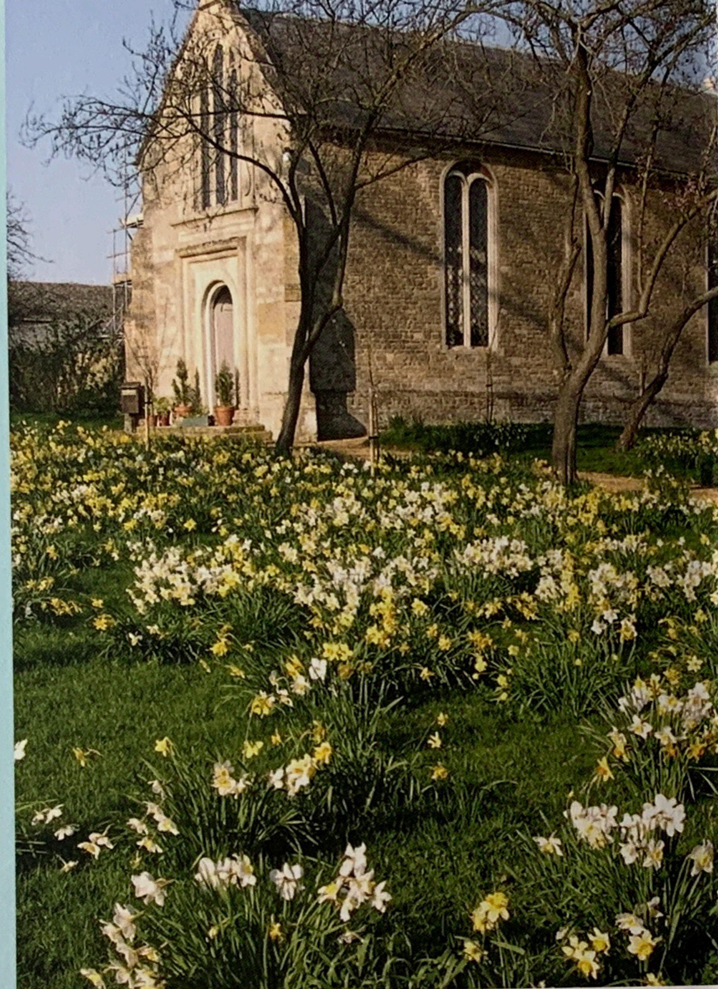
Festival HQ, the Creed Chapel, in Spring. Founded in 1706, the Chapel is 300 years old this year.