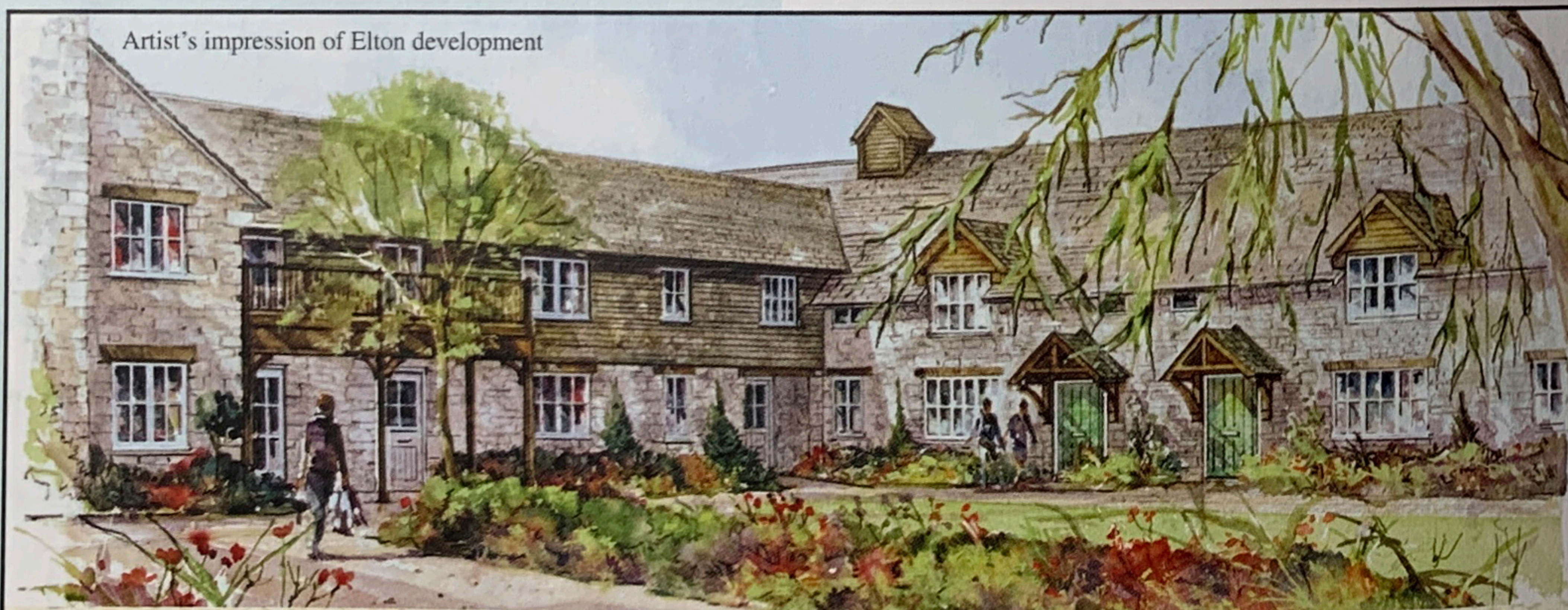
Artist's impression of Elton development

English Courtyard is delighted to sponsor the opening concert of this year's Oundle International Festival and to be bringing its unique style of independent retirement living to nearby Elton in 2007.