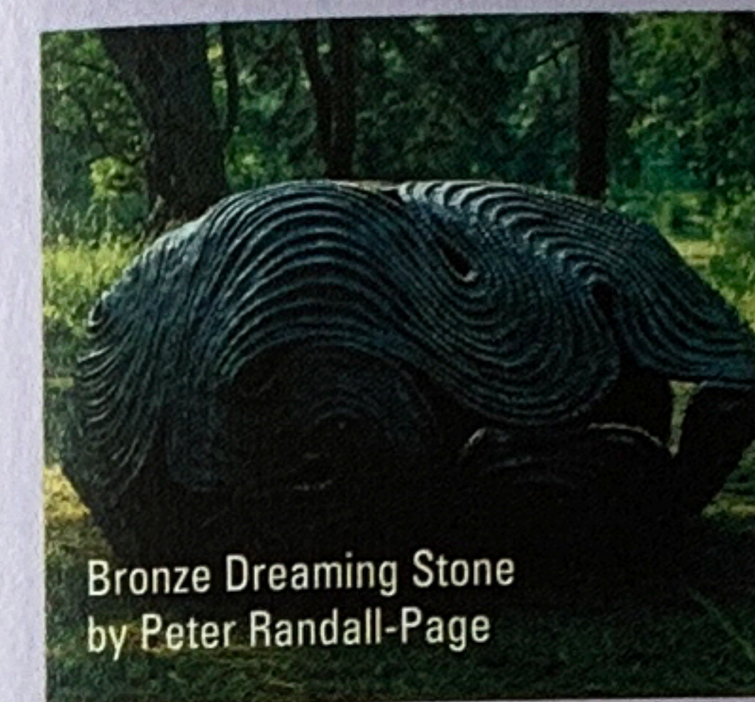
Bronze Dreaming Stone by Peter Randall-Page

A specially-designed audio tour following three miles of public footpaths between Fermynwoods Contemporary Art and the National Trust property Lyveden New Bield.