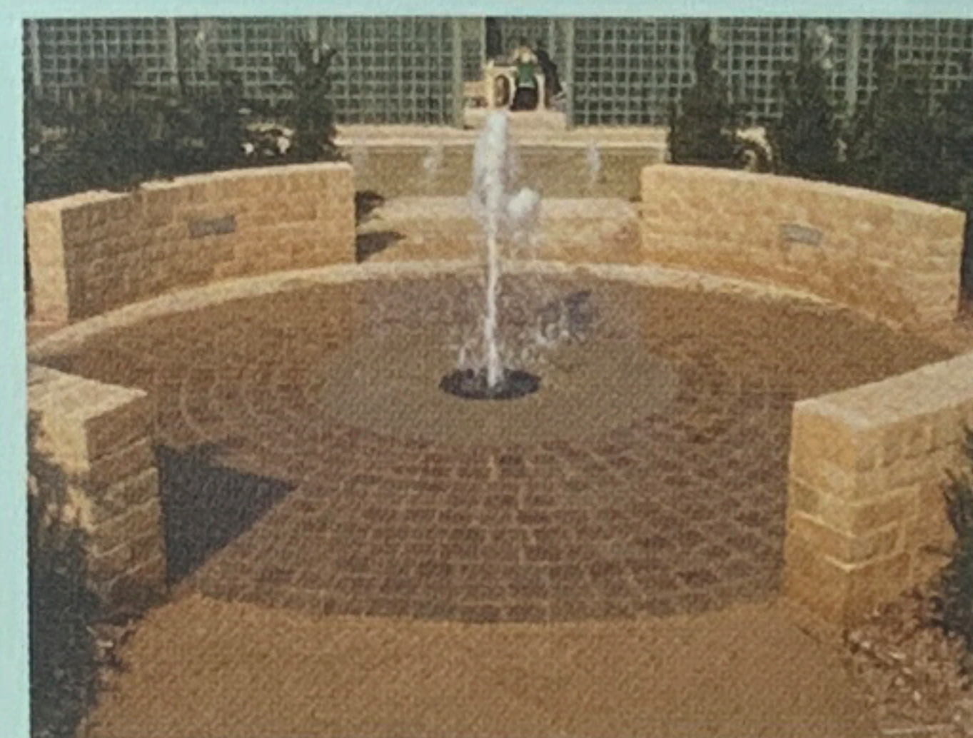
Burghley Garden of Surprises

the evolving garden, which has an emphasis on the bold use of plants, particularly herbaceous and grasses, as well as interesting use of dry stone walling. Carefully sited throughout the garden and adjacent woodland are contemporary works in a range of materials by notable artists, both local and national.