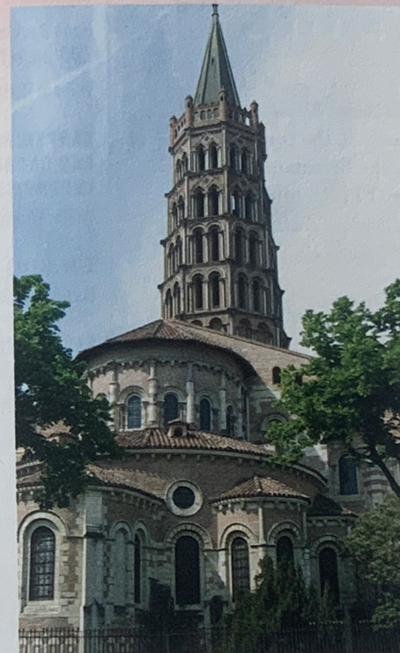
Basilique St Sernin, Toulouse

for conservatoire and university organ students age 19-29