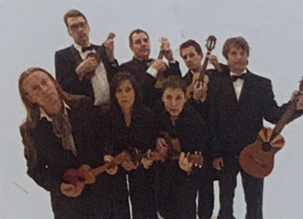
Ukulele Orchestra of GB